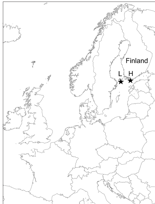
Fig. 1. A map showing the locations of the Hanko (H) and Lågskär (L) Bird Observatories.

Migratory birds have been trapped with mist-nets at Hanko (59°49' N, 22°54' E) and Lågskär (59°50' N, 19°55' E) Bird Observatories in South-west Finland during autumn migration in 1979–2014 and 1973–2012, respectively (Fig. 1). We used the study period 25 July till 15 November at both observatories. At Hanko trapping and observation effort has been relatively constant from 25 July till 5 November annually, and days without trapping are mainly caused by poor weather (rain or heavy wind) than actual observation gaps (e.g., Lehikoinen 2011). In recent years the season has continued until 15 November due to milder late autumns. This migration period does anyway cover the main migration period of all the study species (Lehikoinen & Vähätalo 2000). However, the Lågskär Bird Observatory has more trapping gaps especially in 1990s and 2000s, but we included the data, since another observatory can act as a replicate site because the same breeding population is migrating through the observatories, and the additional data can increase sample size for uncommon species. We do not believe that these ob-